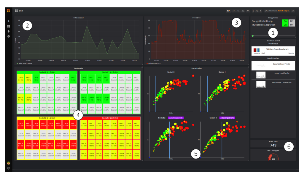
Fig. 3: Full Demo UI with energy controlled processing

can fork the same operator code and apply it to any data partition on its socket to achieve maximal parallelism. Therefore high data locality is important for minimal inter-socket messages and thus less energy overhead for the network communication. An operator will forward its intermediate matching state to the next operator in the chain, until all messages in the system have been processed.